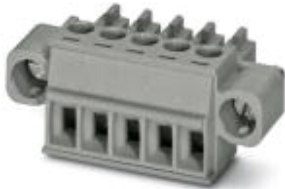
The figure shows a 5-pos. version of the product in gray

Plug component, Nominal current: 8 A, Rated voltage (III/2): 160 V, Number of positions: 18, Pitch: 3.5 mm, Connection method: Screw connection, Color: pastel green, Contact surface: Tin