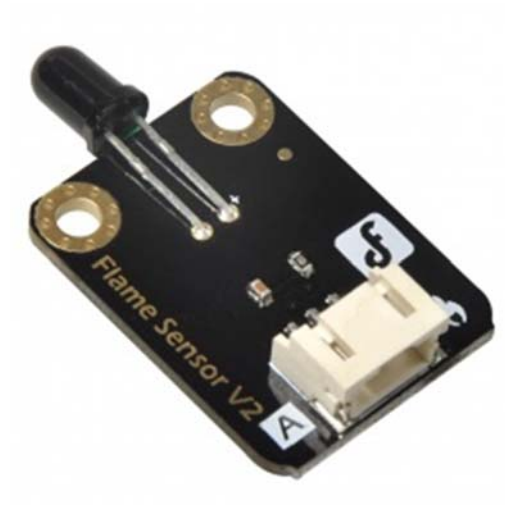
Flame sensor V2