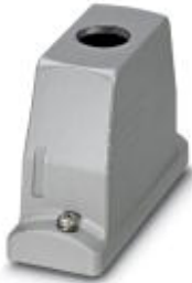
HEAVYCON ADVANCE EMV sleeve housing B24, with screw locking, height 100 mm, with 1x M40 thread, straight cable outlet

Please be informed that the data shown in this PDF Document is generated from our Online Catalog. Please find the complete data in the user's documentation. Our General Terms of Use for Downloads are valid ( http://download.phoenixcontact.com )