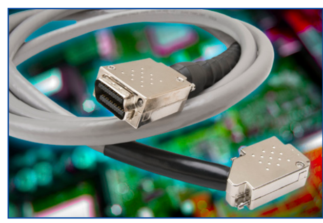
MRJ21 is a trademark owned by Tyco Electronics Corporation used here under license.