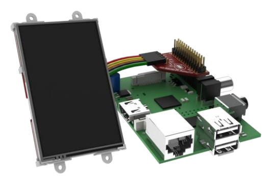
The uLCD-35DT-PI Pack connected together (Note: Raspberry Pi NOT included)