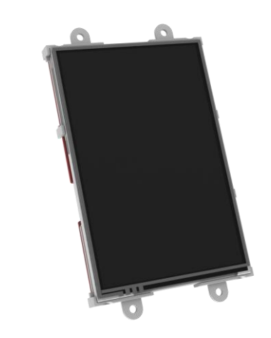
The uLCD-35DT Display Module