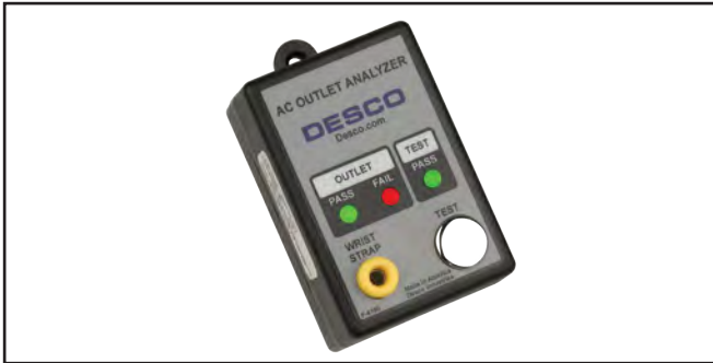
Figure 1. Desco 98130 AC Outlet Analyzer and Wrist Strap Tester