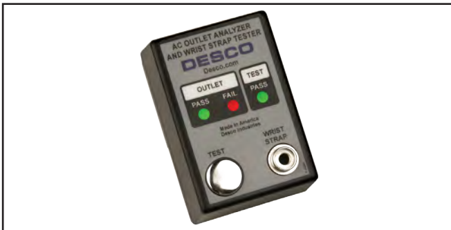
Figure 2. Desco 98131 AC Outlet Analyzer and Wrist Strap Tester