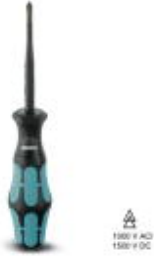
Screwdriver, crosshead PH (lasered), insulated, size: PH 1 x 80, 2-component handle, with non-slip grip

Please be informed that the data shown in this PDF Document is generated from our Online Catalog. Please find the complete data in the user's documentation. Our General Terms of Use for Downloads are valid ( http://download.phoenixcontact.com )