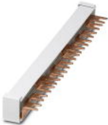
Wiring bridge for modules with connecting pitch 17.5 mm, 4-phase, 12-pos.

Please be informed that the data shown in this PDF Document is generated from our Online Catalog. Please find the complete data in the user's documentation. Our General Terms of Use for Downloads are valid ( http://phoenixcontact.com/download )