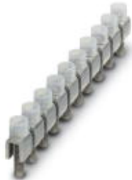
Fixed bridge, Number of positions: 10, Color: silver

Please be informed that the data shown in this PDF Document is generated from our Online Catalog. Please find the complete data in the user's documentation. Our General Terms of Use for Downloads are valid ( http://download.phoenixcontact.com )