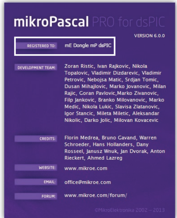
Figure 1-2: mikroPascal PRO for PIC® About Window