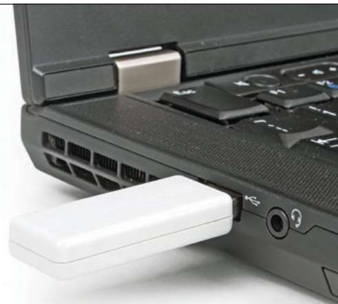
Figure 1-3: USB Dongle plugged into Laptop USB host connector

Unfortunately not. If you lose your dongle you will need to buy a new compiler license and pay the full price.