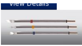
Replacement Soldering Tips P Series