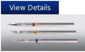
Replacement Soldering Tips S Series