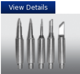
Replacement Soldering Tips H Series